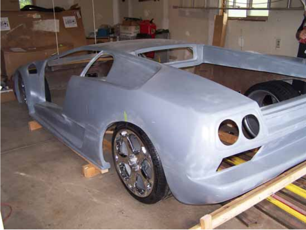
5. Checking wheel/tire track