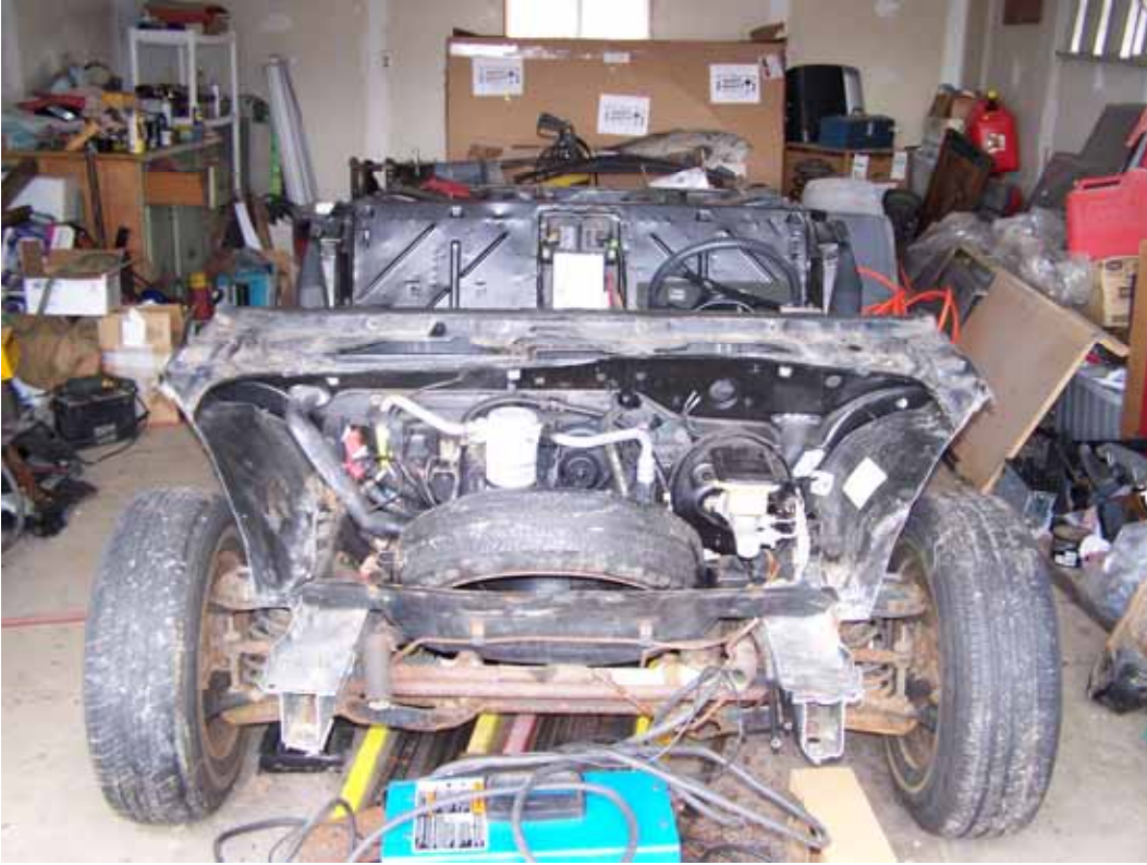
3. Chop, Cut, Rebuild