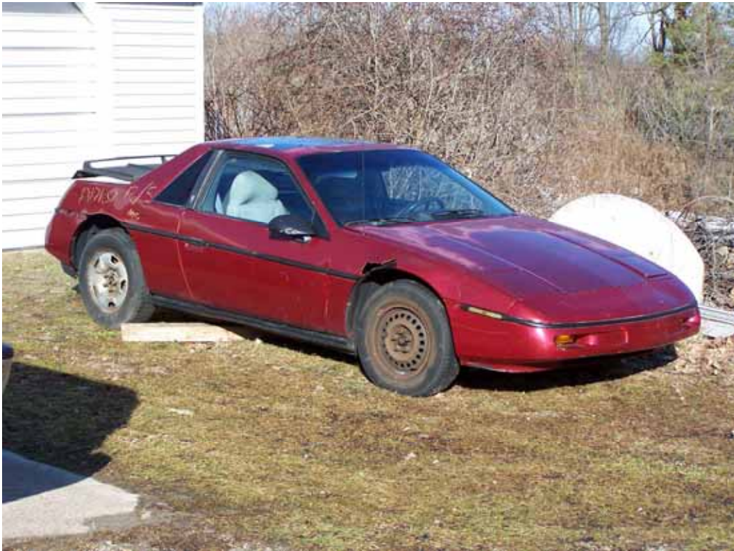
2. My Fiero donor car