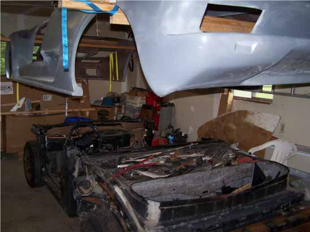
6. Car cabled to the ceiling over donor chassis.