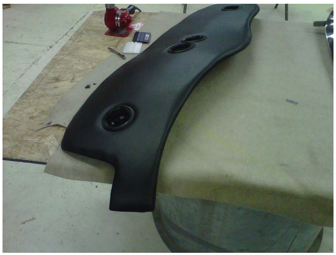
Dash pad is upholstered, padded and with air vents