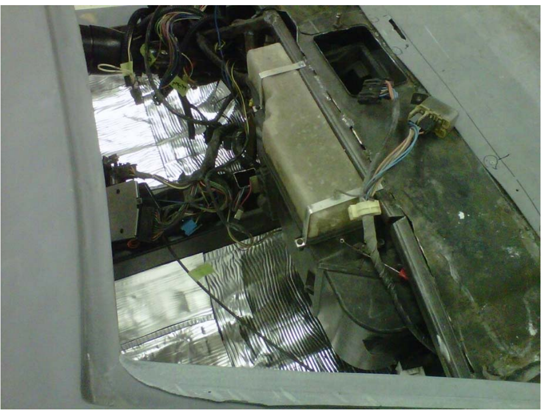
Cleaning up the dash area