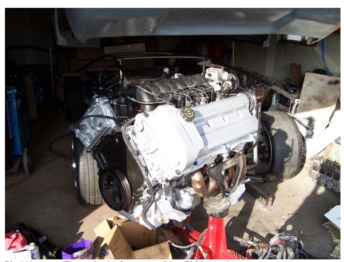
Pic #49. The engine is almost complete. El Monster!