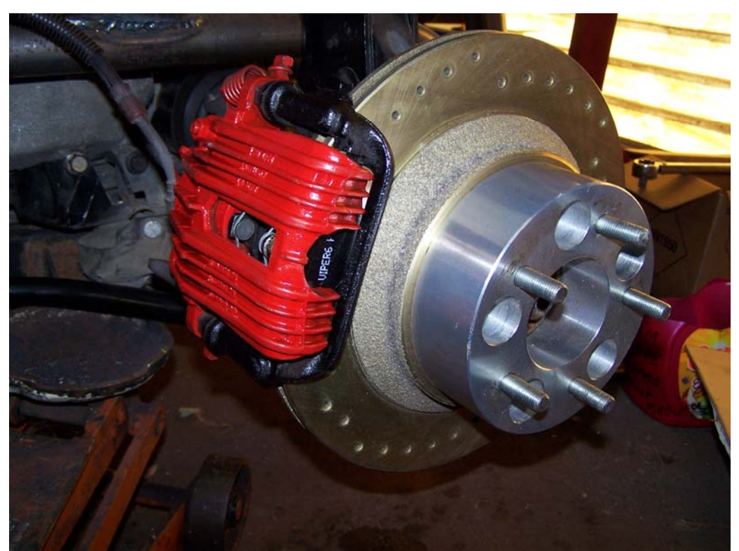
Pic #51. LH rear caliper mounted and looking good