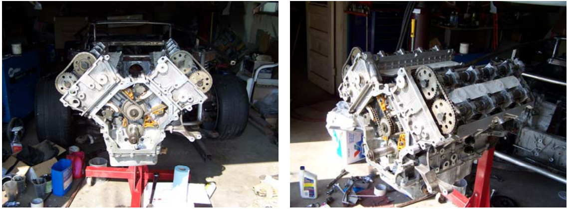
Pic #47 & 48. The Wright Bros. don't have anything over on me. Look at all those bicycle chains!