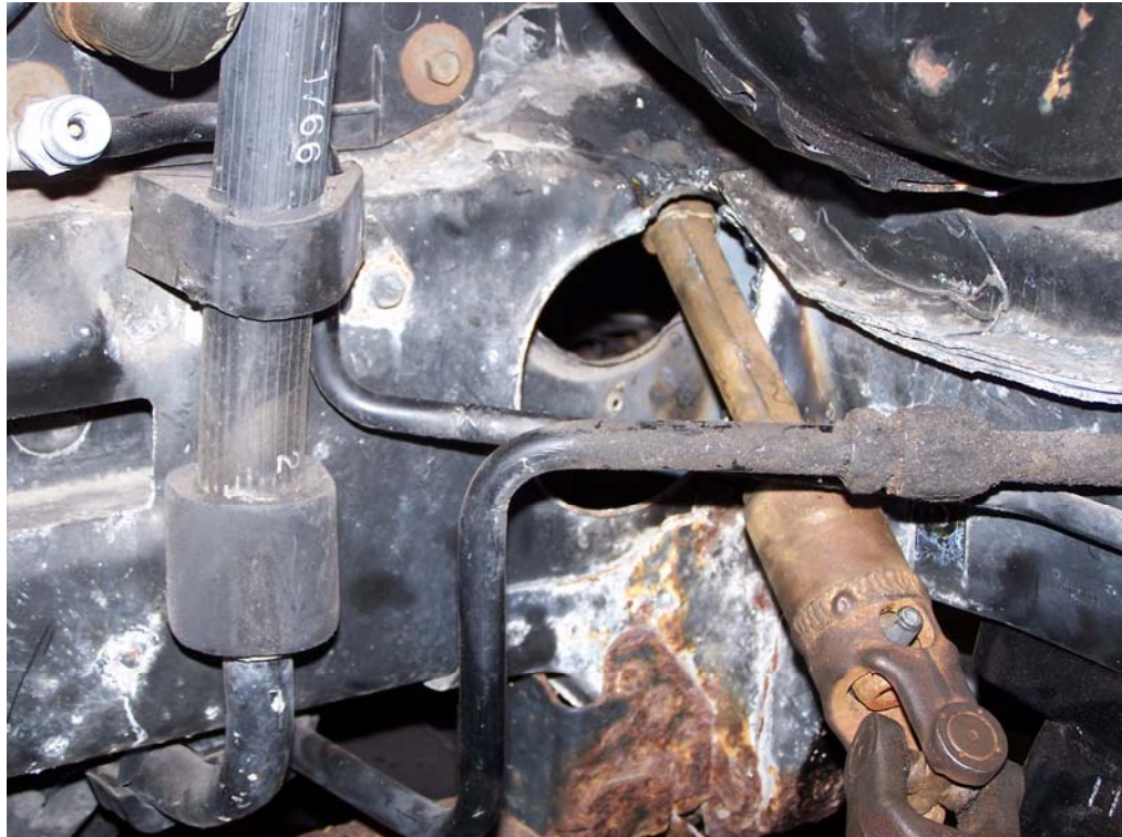
This picture shows the clearance with the lower steering shaft attached to the Rack & Pinion.