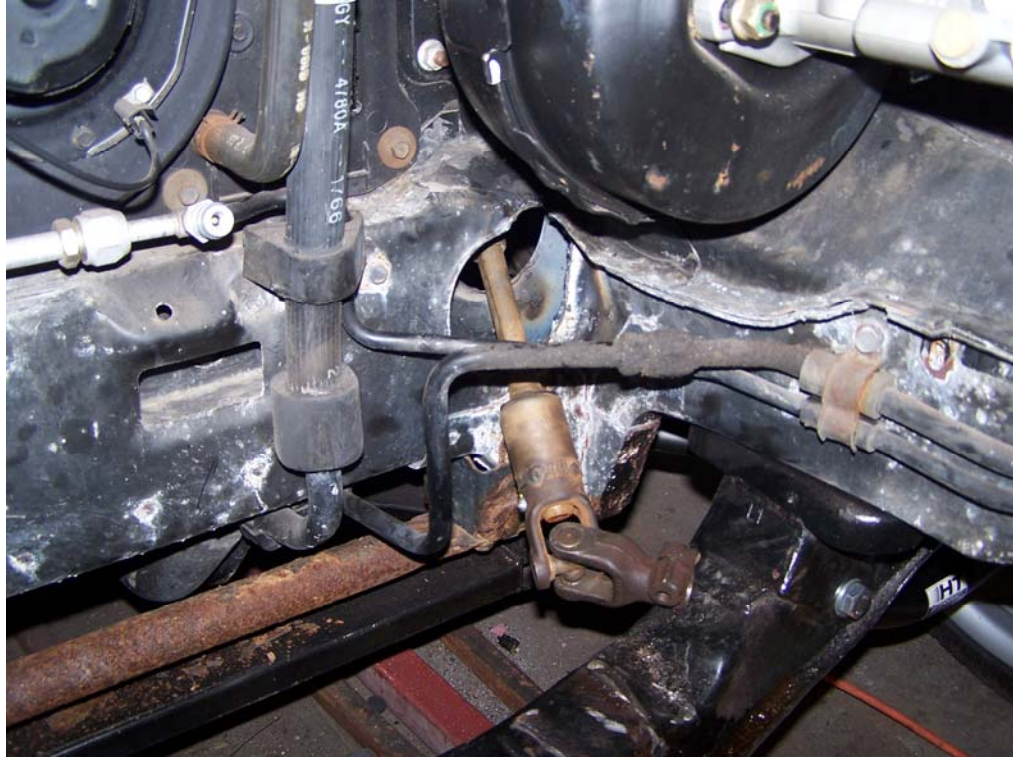
On to a new chapter. Front Power Steering. Notice the outboard cut to allow the clearance of the steering shaft at the front cowl panel