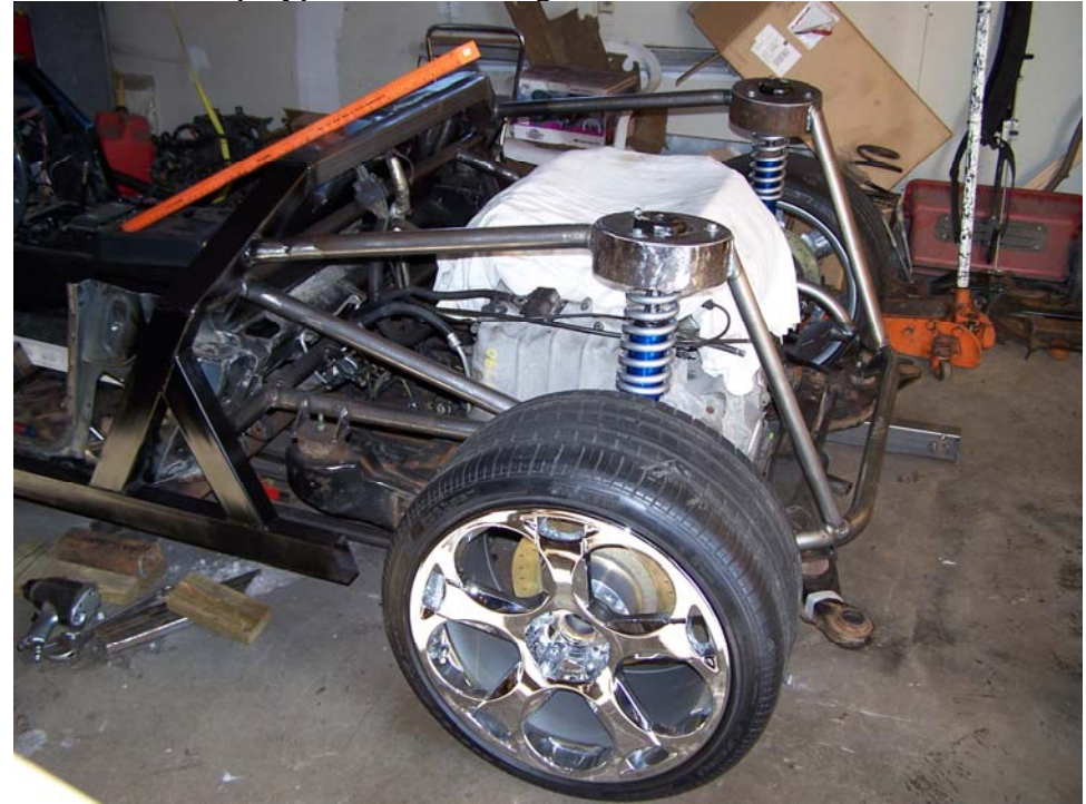
Pic #24 - Finally, the rear suspension is close to completion.

Need a sweater out there??? I painted my Diabolic 6.0 white and I had to move it outside my garage to sweep the floor and wouldn't you know it, it started to snow and now I can't find it??????!!!!!! – Yep, typical with Michigan weather !!