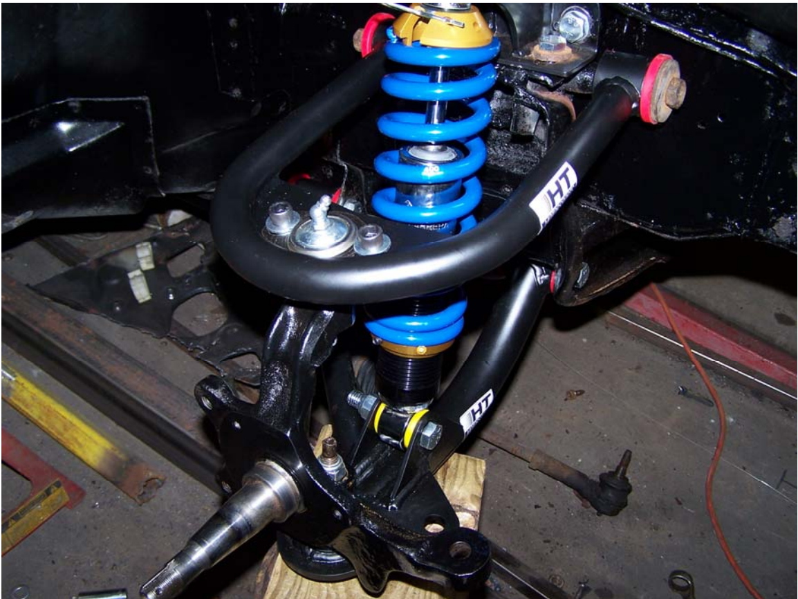
Pic #28 - This picture shows the right front side suspension installed. The HT Motorsports Wide Track Kit is fairly easy to install. Taking off the old a-frames can be tricky. Safety first kids.