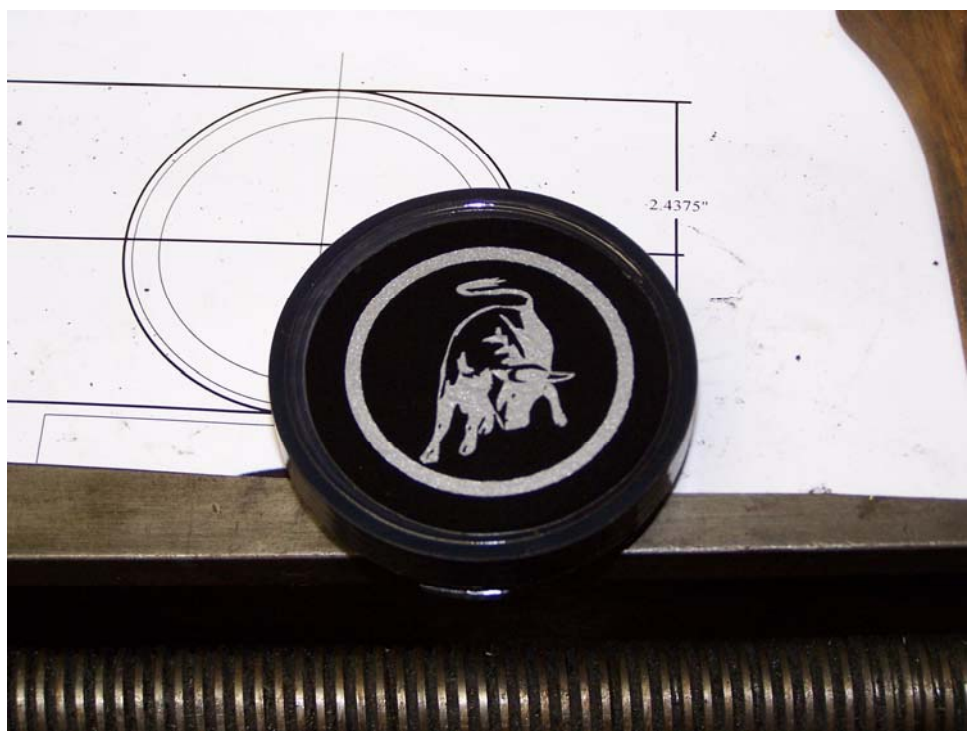
Pic #26 - They took some work but I like the outcome.