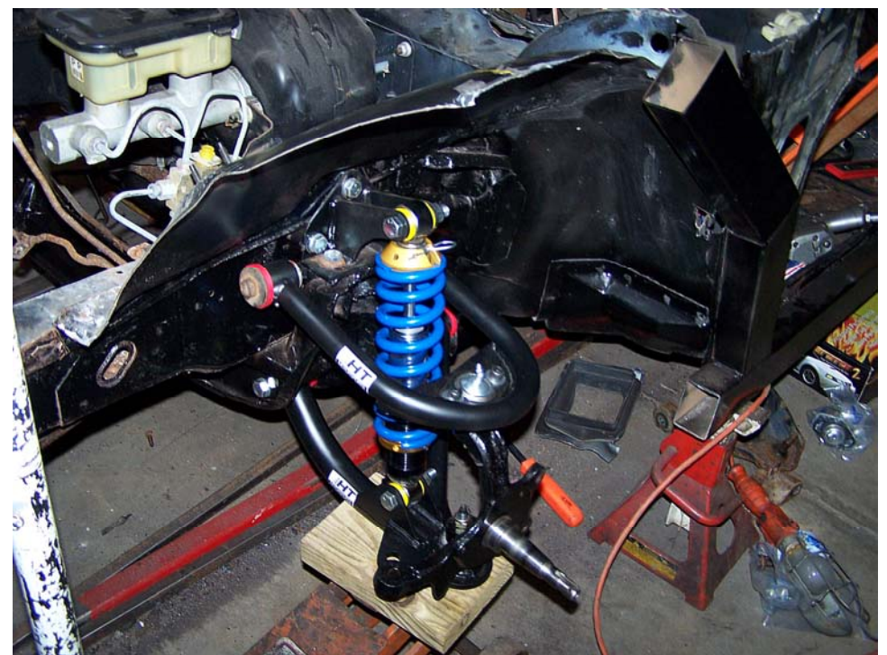
Pic #27 - Back to working on the "beast". I modified the left front and right front upper spring perch per instructions from HT Motorsports (Held Suspension) and then installed the Wide Track coil-over suspension on the left side.