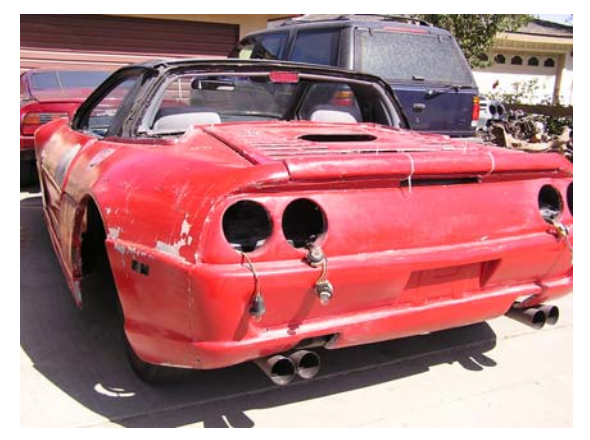
Corvette taillight wiring added.