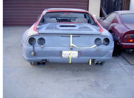
We purchase a Fiero GT hatch, which we cut up and mold into the body kit.