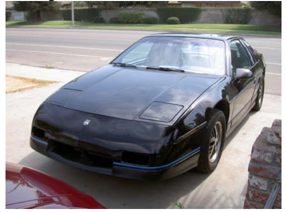
Almost too pretty to cutup