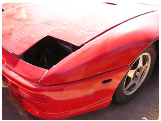
Wider deep-set wheels will be needed. We have a set of 15" X 8" for the front, and 15" X 10" for the back that will be installed