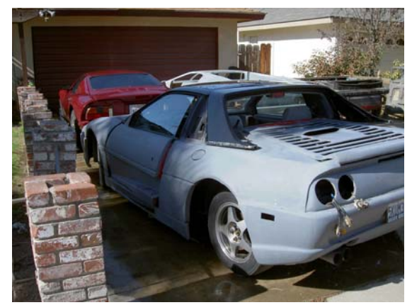
Looking at options to do rear roofline