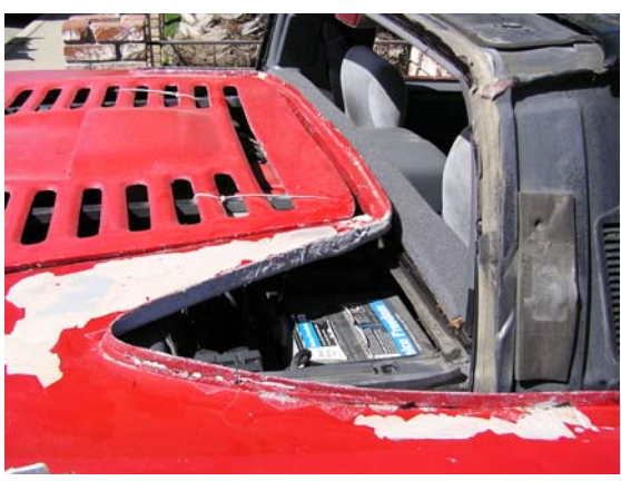
Kit was originally designed for a convertible model, but we have seen a lot of them that remain "topless." We decide to leave the Fiero hardtop and sunroof.