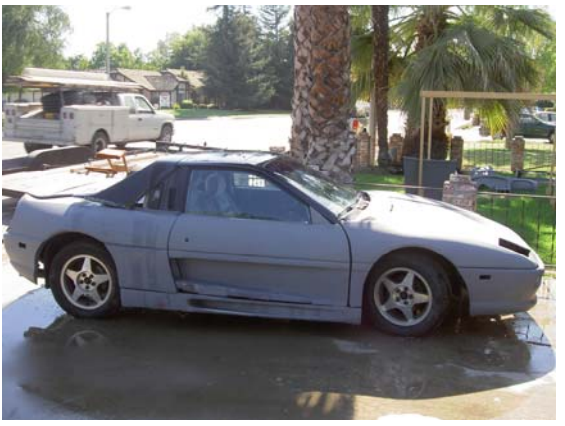
Roofline is just not quite right with the Fiero rear hatch