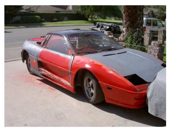
Starting to cleanup the body and touchup with grey primer