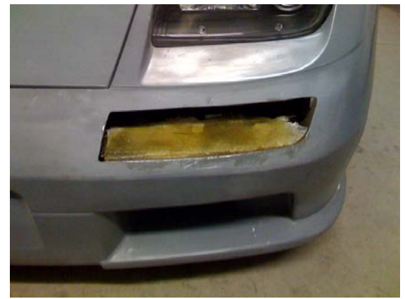
All I did was make a Flat piece for the light to have a resting place. Will also bolt to fiberglass.

This is a better shot. Tomorrow (Sunday) I will be installing the fog lights! Can't wait to take a picture of that front end! I figured by advancing into installing those lights would give me a better view of what I'm almost ready to be driving on the road! Gives me tons of motivation points!!! As far as engine I will be