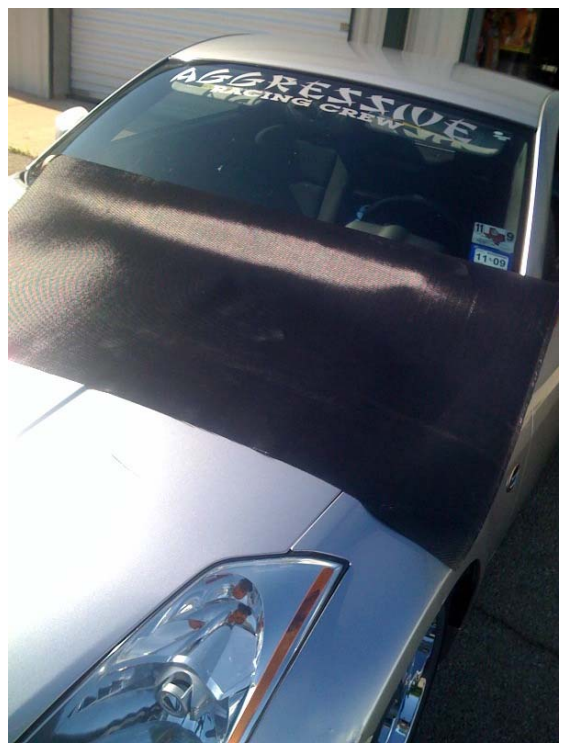
Ordered 5 yards of Black Fiberglass