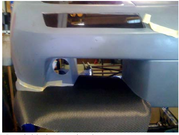
Material being put in place