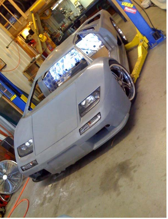
I still need to finish up the body work. But here Is a rough look at the finish product. As you can see I'm still working on the carbon fiber lower pieces. I'm making a mold next week to fabricate better looking pieces.