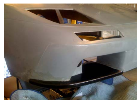
Black fiberglass with resin installed.