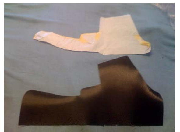
Template of material to be installed