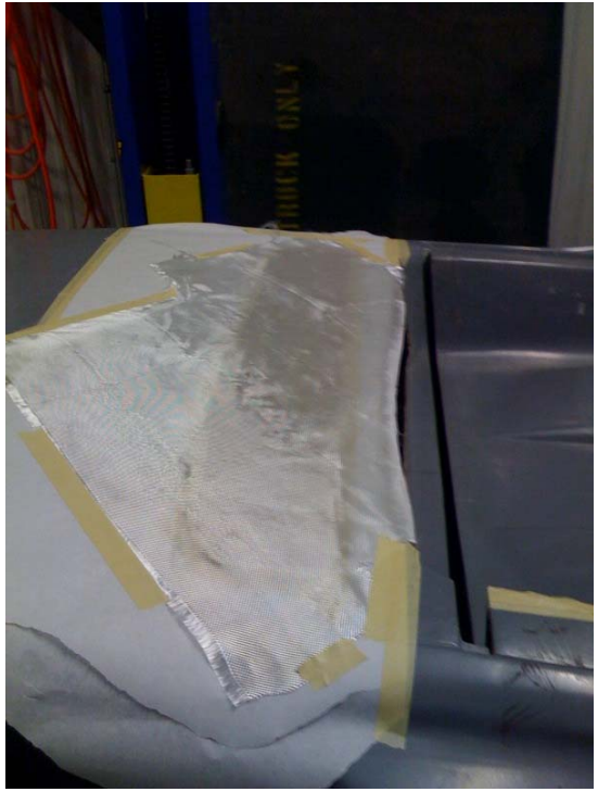
Laying fiberglass cloth for construction