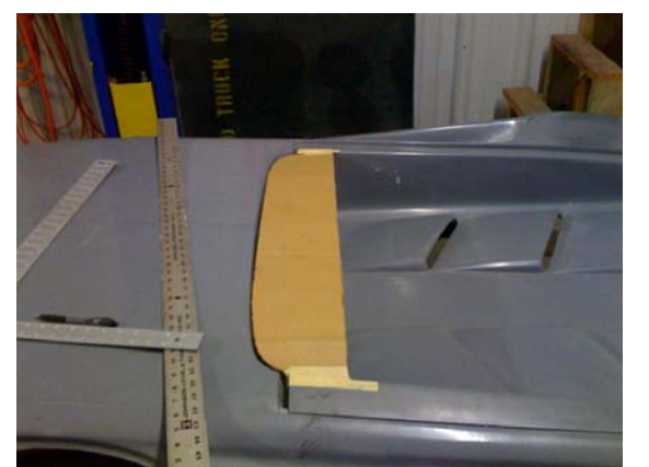
Cardboard template for adding 3<sup>rd</sup> brake-light