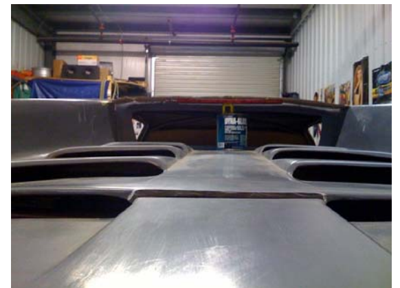
Tail view of brake-light addition