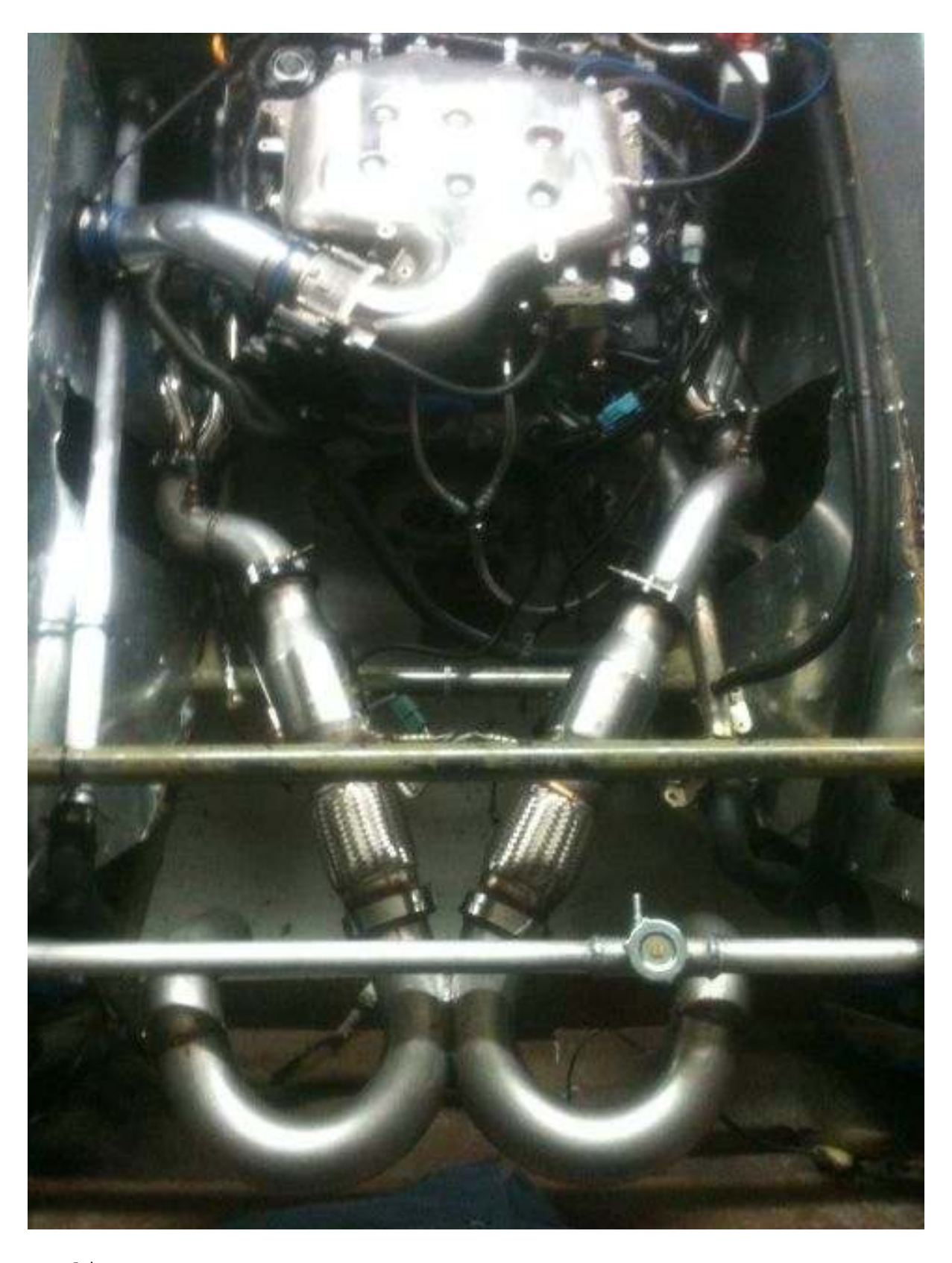
-Felipe Speed Shop Performance