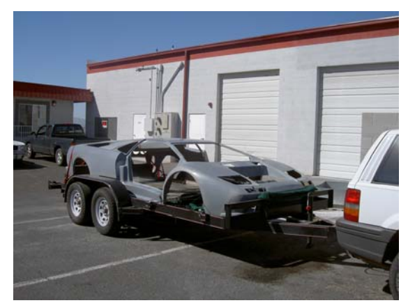
Picking up at the Fiberglass shop

NOTE: Many of the fabrications can be seen in the "How To" section on the Web Site