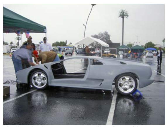
Trying body on custom chassis at Show