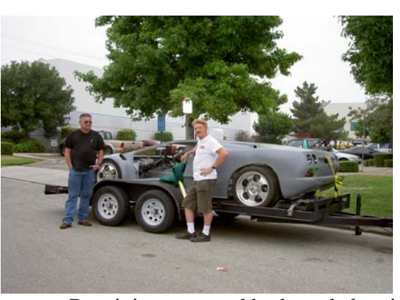
Receiving mounted body and chassis