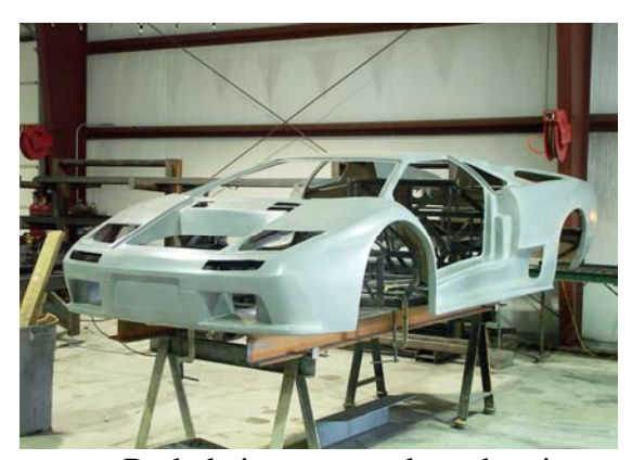
Body being mounted on chassis