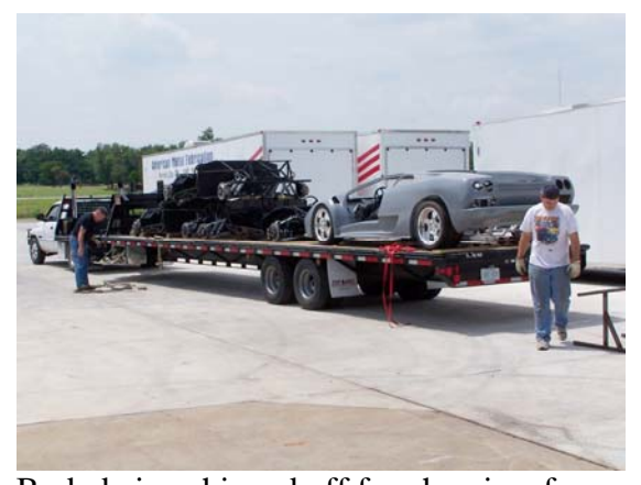
Body being shipped off for chassis mfg.