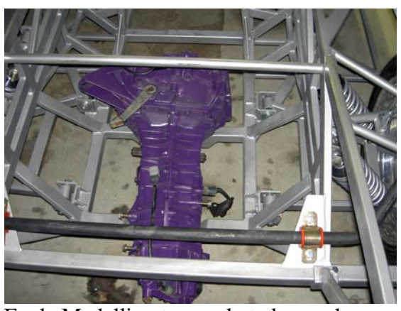
Eagle Medallion transaxle to be used