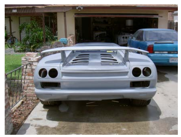
Rear wing mounted