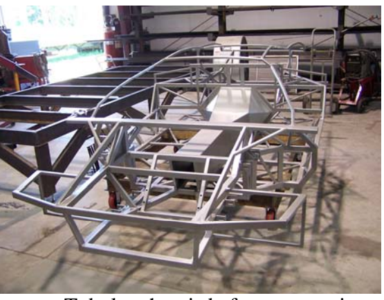
Tubular chassis before suspension