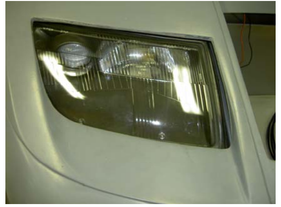
Checking headlight for fit