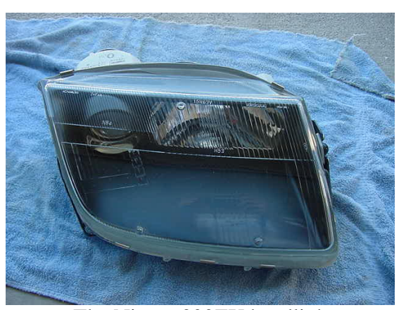
The Nissan 300ZX headlight